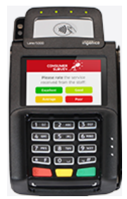
Ingenico Lane 5000

Mobile, battery powered color screen and signature capture for EMV, contactless and swiped transactions