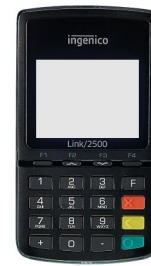
Ingenico Link 2500

Internet powered color screen for EMV, contactless and swiped transactions